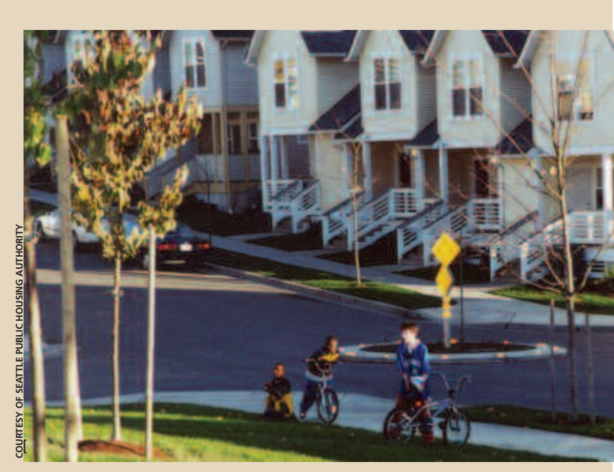
In an effort to deter gentrification, Seattle's public housing authority seeks to spread lower-income housing throughout the city. NewHolly is a HOPE VI housing development with 800 rental units and 400 for-sale homes priced for a mix of incomes.

Despite the city's admirable record of funding the creation of housing for lower-income households, challenges remain. As in many cities, the rate of affordable-housing production in Seattle has been slowed by the rising cost of land acquisition. In addition, Lorig noted that the phenomenon of rents increasing much faster than incomes has caused displacement.