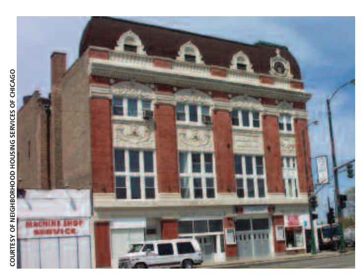
As neighborhoods change, buildings often have many lives. Now owned by a religious organization, the Douglas Park Auditorium, constructed in 1910, was home to popular early-20th-century Yiddish theater performances.