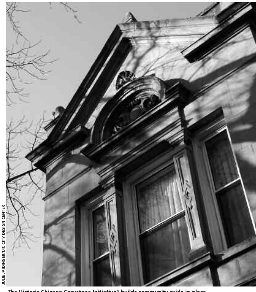
The Historic Chicago Greystone Initiative® builds community pride in place, stimulates reinvestment, increases homeownership, and promotes property improvement throughout North Lawndale.

Although seeking to maintain affordability in the community is clearly an important factor in mitigating the inflationary effect of gentrification, improving economic opportunities for current residents—to help them afford new market prices—is also a vital step. Communities that recognize the potential for gentrification early can mobilize resources to help local residents share in the benefits. Access to better jobs provides residents with increased income to afford market-rate housing. Transitioning